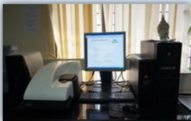
Zeta Potential Analyzer