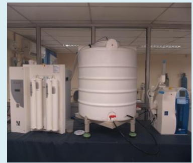
Ultra Pure Water System Milli Q Direct 8 Elix