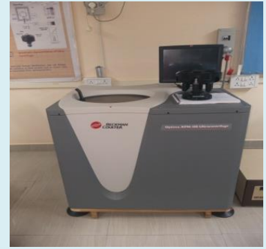
Ultracentrifuge Optima XPN-100 Beckman