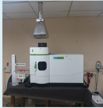
ICP-OES-8000 Perkin Elmer