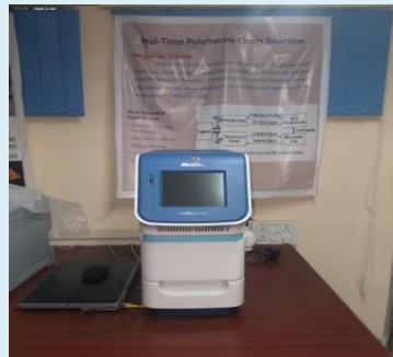
Real Time PCR ABA System Step one plus