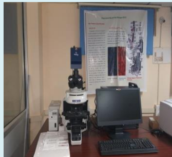
Fluorescence Microscope Olympus-Bx53