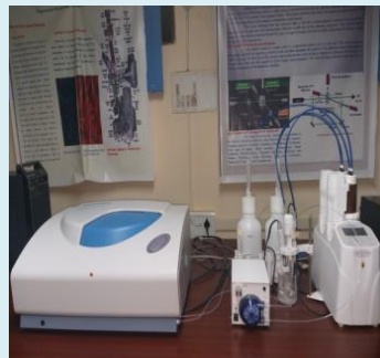
Particle Size Analyzer SZ-100 Horiba