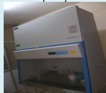
Bio safety Cabinet level-IIA