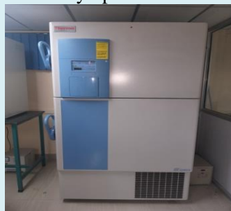
-80°C Ultra Low Freezer T