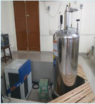
NMR 400MHz Jeol India